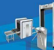
Metal Detector & Walk Through Gates