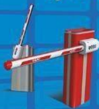
Gate Barrier Systems