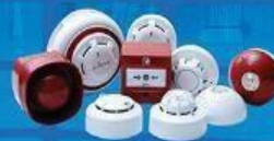
Fire Alarm Systems